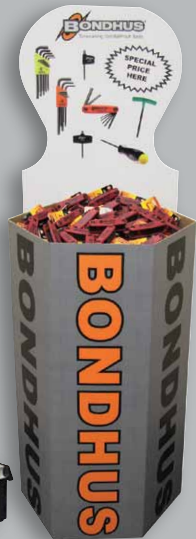
EDP#95022 (Box Only) Dimensions: 22" W x 62" H x 19" D 56cm W x 158cm H x 49cm D