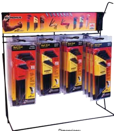
Dimensions: W 15 1/4" x D 9 1/2" x H 15 1/4" W 39cm x D 24cm x H 39cm

Perfect for counter top or rack mounting. This merchandiser is stocked with our most popular L-Wrench sets ensuring quick turns. An interactive Ball End L-wrench demonstration is integrated into the design to illustrate its time saving feature.