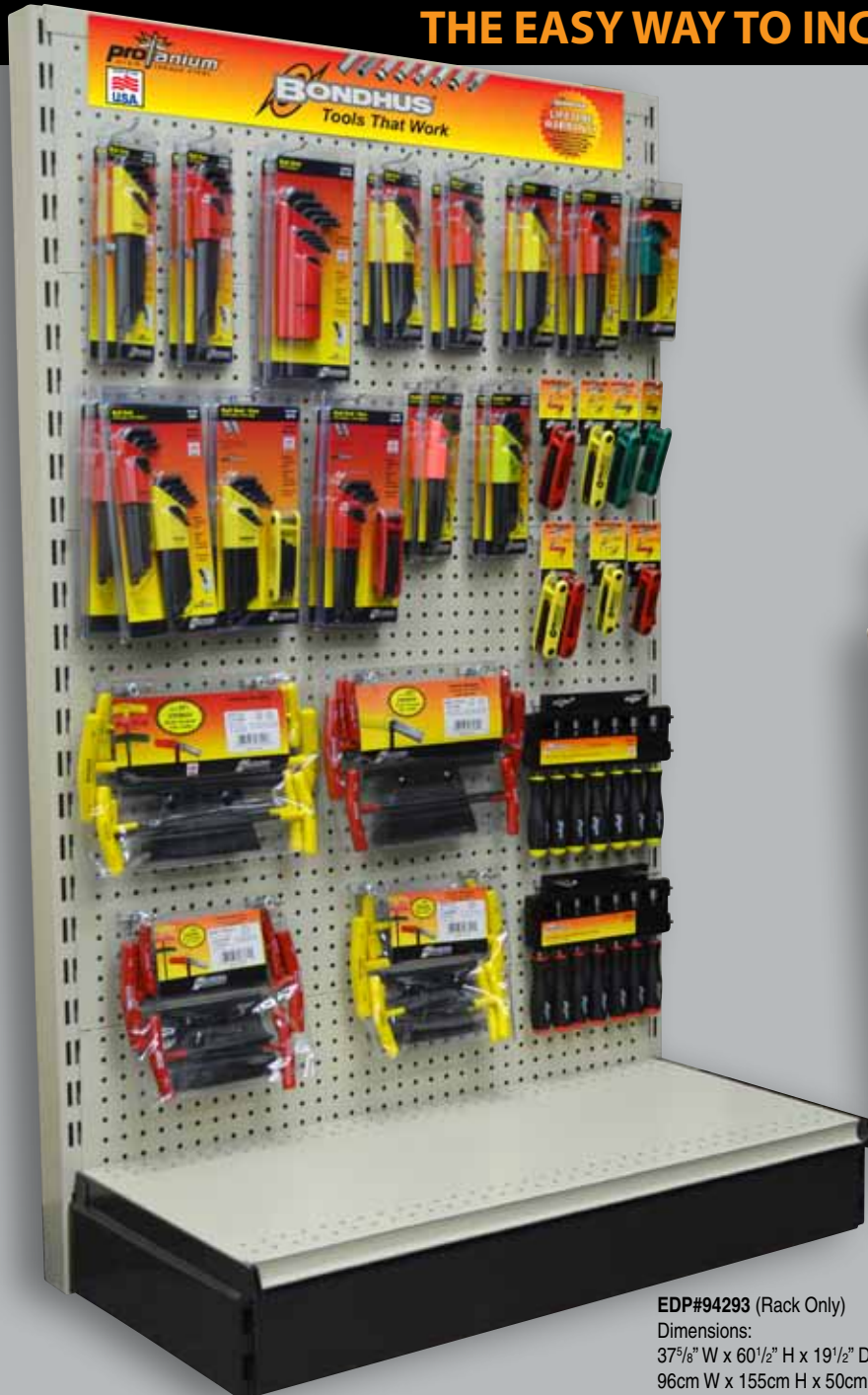
EDP#94293 (Rack Only) Dimensions: 37 5 / 8 " W x 60 1 / 2 " H x 19 1 / 2 " D 96cm W x 155cm H x 50cm D