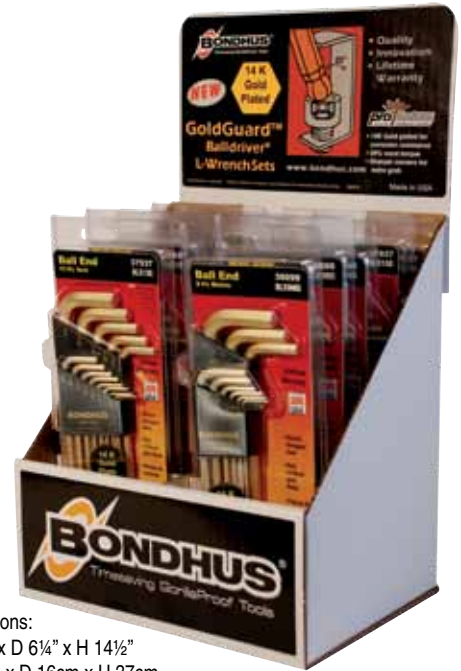
Dimensions: W 8 1/2" x D 6 1/4" x H 14 1/2" W 22cm x D 16cm x H 37cm